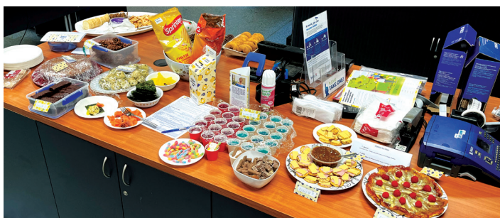
Staff enjoying the Biggest Morning Tea.