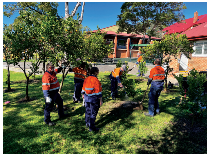
Koppers' staff at Mayfield West Public School.

Everyone enjoyed the BBQ our team put on after the hard work was done.