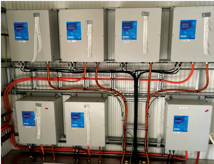
The variable speed drives are now installed.

The solar panels have been in place since April. In July, they generated 7,785 kilowatt-hours (kWh) of electricity. This is equivalent to the annual electricity usage for a household of four.