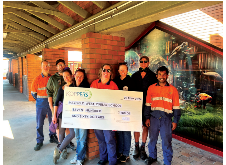
Our team with the big cheque for the Mayfield West Public School Earth Day.

We also contributed to a large wooden picnic table for the orchard with a cheque for $760 for the school to use to support learning through active play.