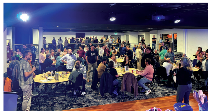
The Trivia Night in full swing!

To find out more or join us in supporting their programs visit firstchance.org.au