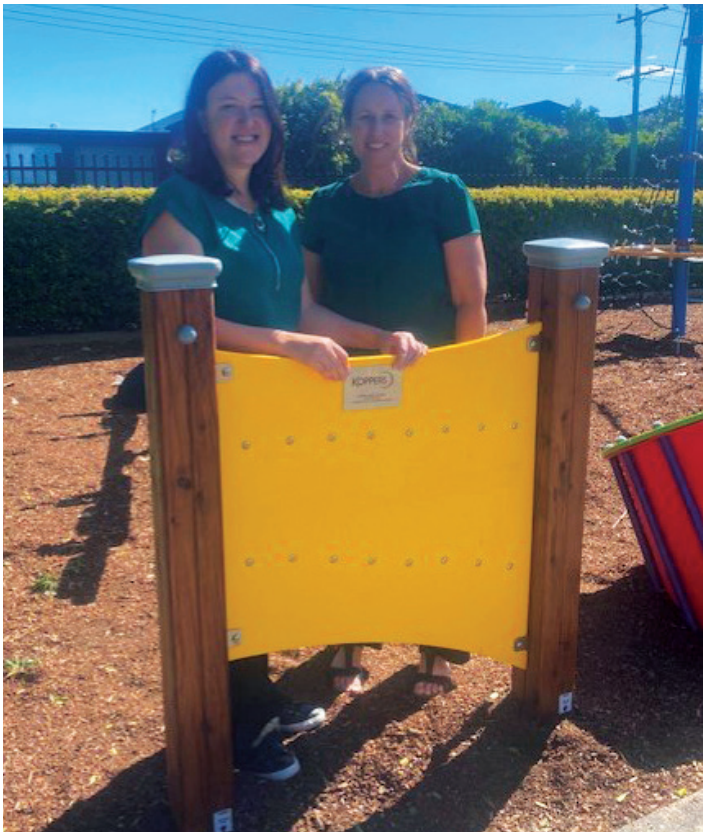
Teachers from Islington Public School with a plaque recognising Koppers' donation.